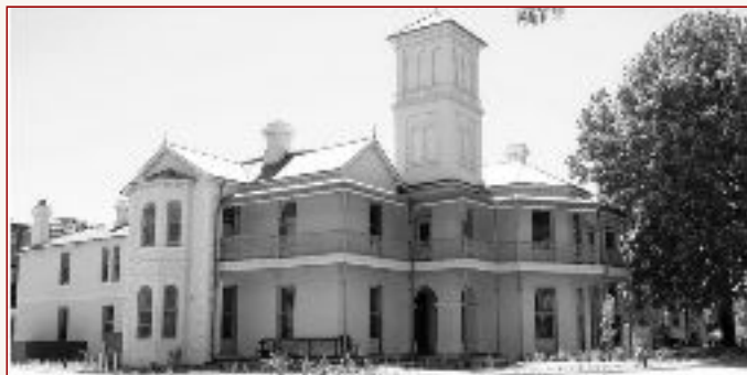
Holy Spirit Seminary

The former Convent served as the Australian International Conservatorium of Music for a number of years until 2013. Today the former Convent, historic Kenilworth House, has been restored to become the Holy Spirit Seminary, training our future priests. The Holy Spirit Seminary was opened on 26 May, 2013 by Archbishop Anthony Fisher.